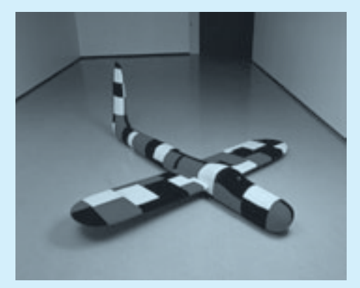
Peter Robinson, Untitled , 1994, polystyrene, fibreglass, glass, wool, velvet, linen, 1620 x 4500 x 4100mm. Collection Te Papa Tongarewa The Museum of New Zealand, Wellington.

experience, Robinson has been increasingly making form speak; and coaxing us, as consumers of the work, to re-produce its meaning through the immediacy of a visceral relationship with material stuff.