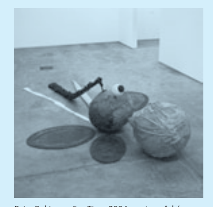
Peter Robinson, Fag Time, 2004, papier-mâché, wire, polyurethane, pigment, steel, dimensions variable.

Often, critical commentary would formulate a reductive reading of these works, positioning his exhaustive referencing as nihilism in reaction to cultural construction, and, in the context of the Venice Biennale, to the pressures of national representation. Being Maori is an ever-present concern for Robinson – it is one of the underlying threads that make up his complex and multistranded works – and it seems that he certainly reflected on these complexities in the exhibition premise of Divine Comedy . Knowing that the