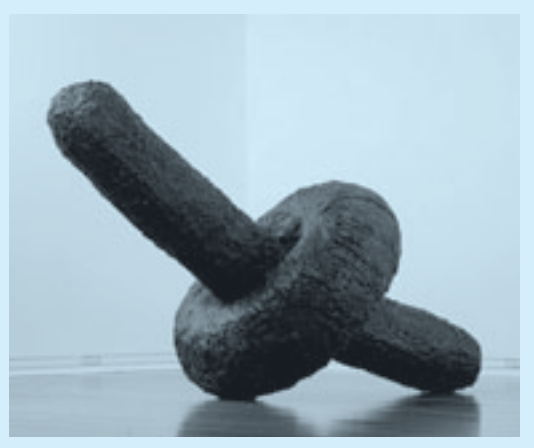
Peter Robinson, Das Es , 2005-6, mixed media, 3500 x 1500 x 1500mm. Courtesy of the artist. Photograph Bill Nichol, courtesy Dunedin Public Art Gallery.

became an intense layering and anarchic overflow of material, which layered up a flux of connections that continually fed back into the work's concern. Attentive to the dysfunction, the seduction and the compulsion of excessive consumption, Robinson seemingly created a mash-up of deliberate imbalance as a comment on the unobtainability of relational balance and bodily equilibrium. This work also appeared to show an understanding of knowledge as predicated on a confluence of indirect and untranslatable forces. While The