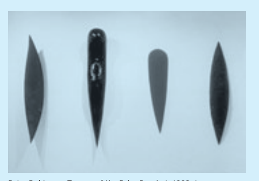
Peter Robinson, Tongue of the False Prophet , 1992, tar, wax, earth, pasta, glass, wool, fibreglass, polystyrene, 4 units: 1350 x 300 x 210mm; 1700 x 300 x 220mm; 1800 x 300 x 450mm, 1650 x 300 x 300mm. Collection Te Papa Tongarewa The Museum of New Zealand, Wellington.

strategy he actively resisted the meaning of his work being subsumed by the political agenda of others.